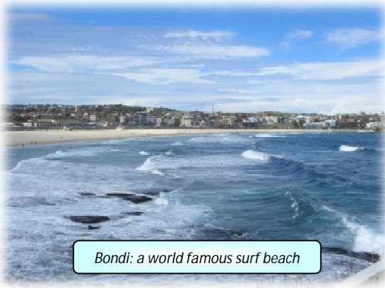
Bondi: a world famous surf beach

If you need further assistance, you may make an appointment to speak with our Housing Officer who can advise you on seeking rental accommodation arrangements in Sydney.