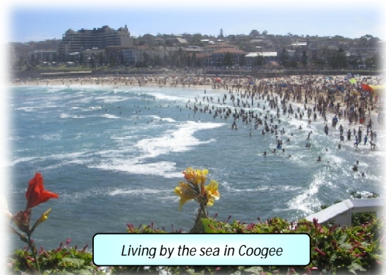
Living by the sea in Coogee