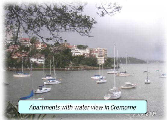
Apartments with water view in Cremorne

People living in Sydney's Northern suburbs tend to have high income and work in top executive jobs in the nearby North Sydney or Sydney central business district. Also, many migrants from the UK prefer to live in the Northern suburbs.