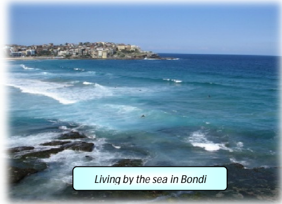
Living by the sea in Bondi

If you choose the option of renting property, you are expected to pay a bond (security deposit) equivalent to one month's rent on top of having to pay for your furniture and all the utilities bills.