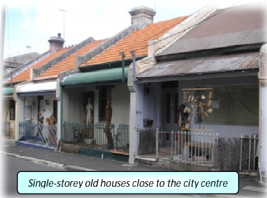
Single-storey old houses close to the city centre