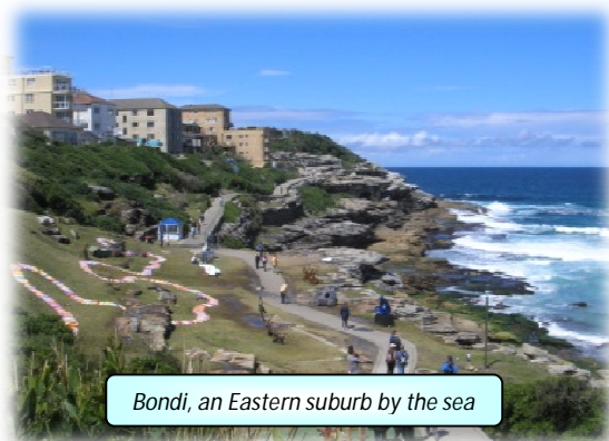
Bondi, an Eastern suburb by the sea

The Eastern suburbs are also a very expensive area to live in with many restaurants around. Some Eastern suburbs like Bondi, Bondi Beach, Coogee attract many tourists due to their lovely beaches and other suburbs such as Vaucluse and Watsons Bay have got lovely water views and many synagogues.