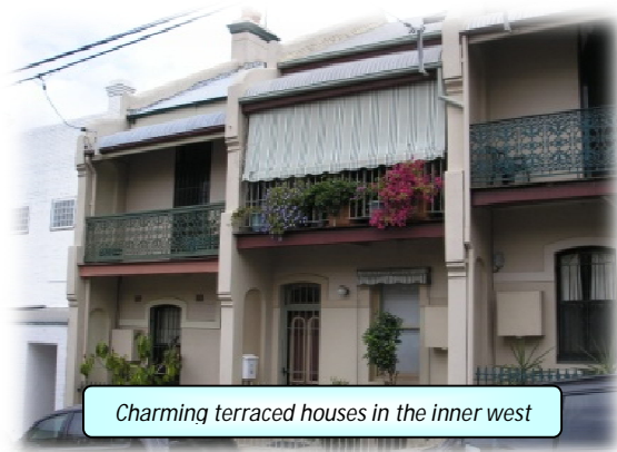
Charming terraced houses in the inner west

As for the Southern suburbs , they are populated with ethnic groups or people who immigrated to Australia. Areas such as Punchbowl and Bankstown provide cheaper accommodation and the property value is within the range of A$100,000 to A$600,000. Having said this, areas south to Sydney are also populated with Australian-born nationals. There are also many mosques based in these areas.