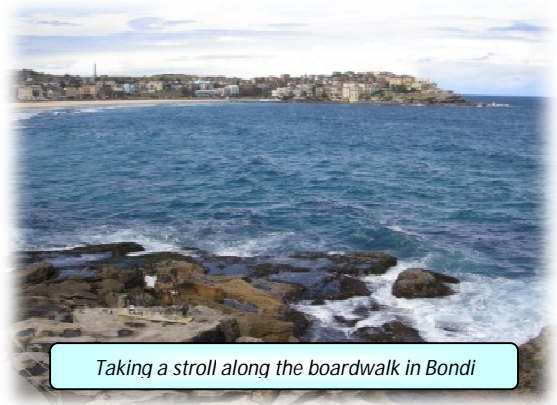
Taking a stroll along the boardwalk in Bondi

If you want the college to provide you with the accommodation placement service or homestay program , you need to let us know when you fill out the Application Form for enrolment. Please note that there is a nominal fee for such placement service, and your minimum stay in the pre-arranged accommodation must be at least FOUR weeks. Please contact us via email for more details.