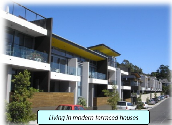
Living in modern terraced houses

Check out the following useful websites that provide excellent information on many rental accommodation listings, options and costs.